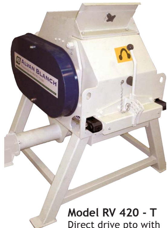
Model RV 420 - T Direct drive pto with fixed stand and side discharge screw.