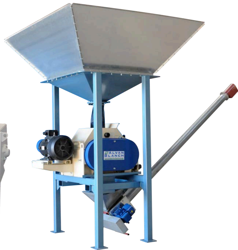
Model RV 420 With feed hopper and auger.

RV mills are of a very strong unitary construction with main body sections continuous welded in 10 mm plate. The large diameter (355 mm/14") rolls, one grooved and one plain, are machined from quality cast iron, precision balanced and mounted on 60 mm (2 1/4") shaft and bearing assemblies - with dual coil spring protection from foreign objects.