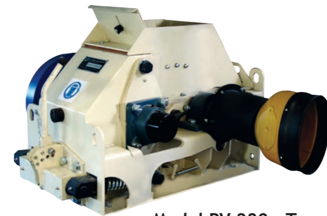
Model RV 280 - T With direct drive pto.