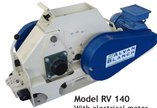
Model RV 140 With electrical motor.