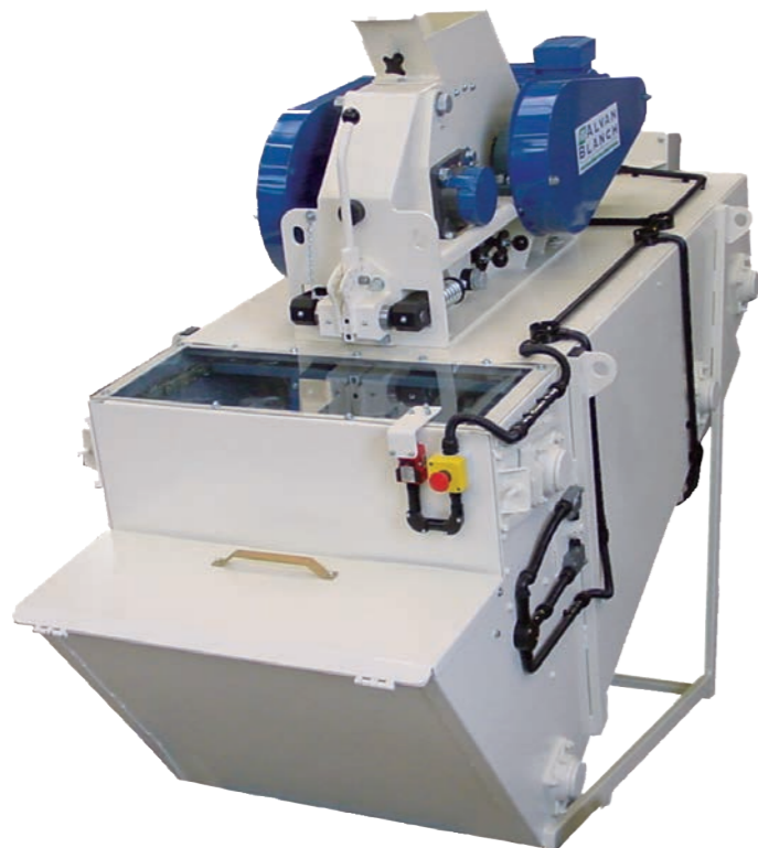
Typical Mill/Mixer installation RV140 Roller Mill on M28 Meal Mixer